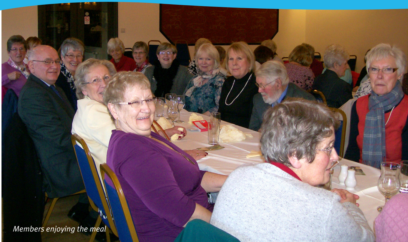
Members enjoying the meal