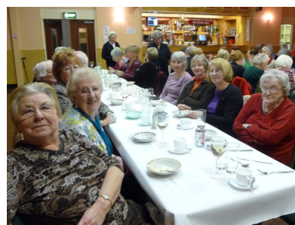
Members wait for the next course to be served ... and the birthday cake

PS Your Development Officer was delighted to attend, but is ashamed to say that she fell off her high heels on the way there. Branch members went into full healthcare mode and looked after her wonderfully, even providing a pair of (sensible, flat) shoes for her to go home in. Thank you to you all!