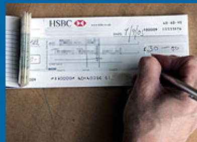
What will replace the chequebook?

The price will be £25 per person and Branch Secretaries will be asked to make bookings in the very near future.