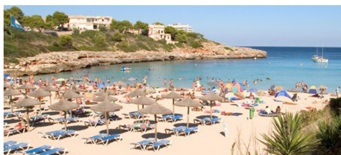
The beach at Porto Colom