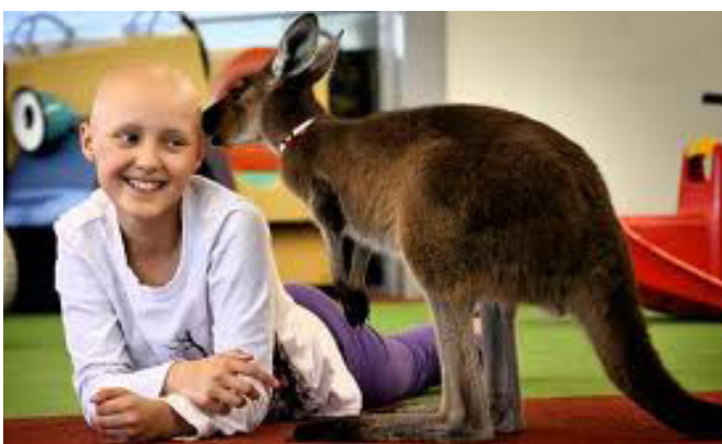
It's not like Seafeld at the PMH