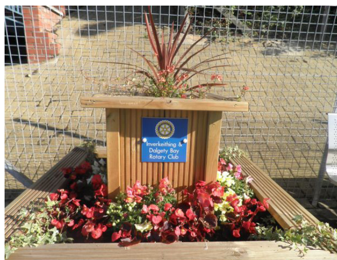
A planter adopted at Dalgety Bay station

I felt honoured to be offered a tour of Princess Margaret Hospital for Children. It was an amazing experience to see and hear about the tremendous developments in child health care since my days at the Seafeld Children's Hospital in Ayr".